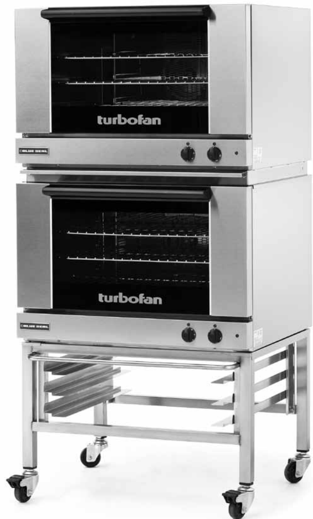
Model E27M3/2C shown